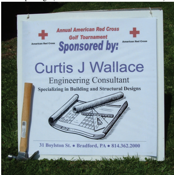
Sample Sign (note hammer in left corner for size)

Tee or Green Sponsorship Form on other side!